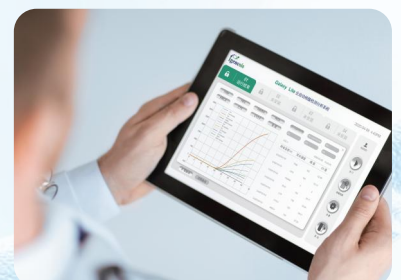
Results report automatically