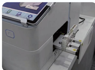
Load iCassette to the instrument